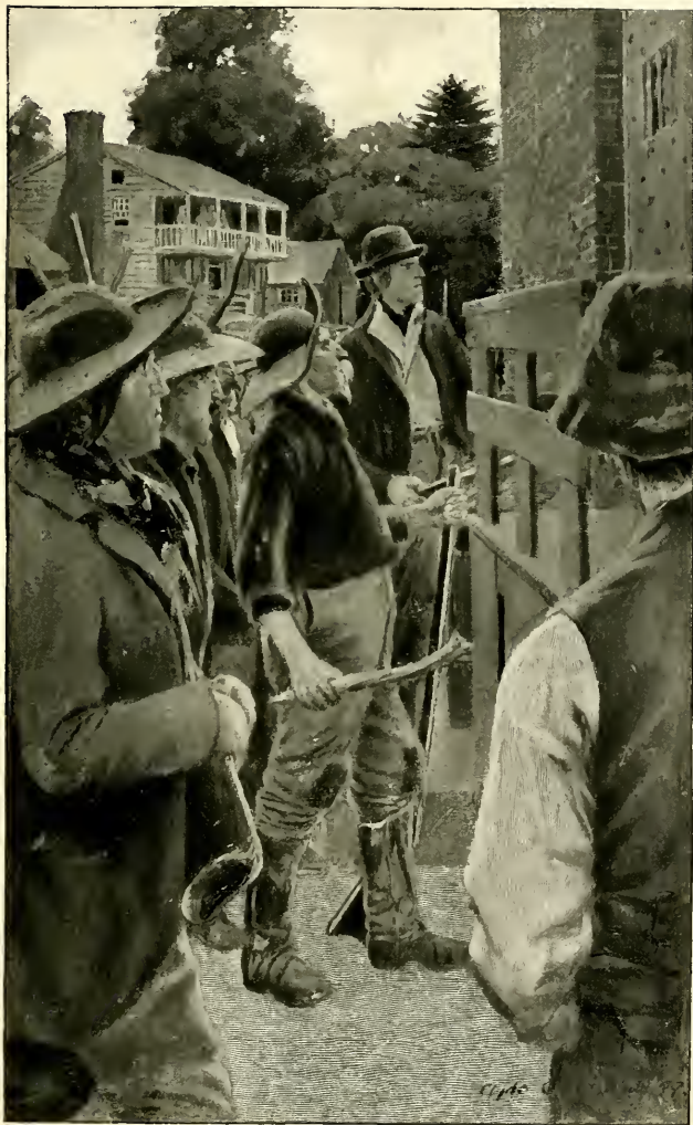
"WE'LL BU'S' THE DO' OPEN"